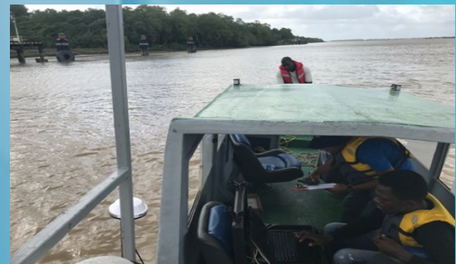
Survey vessel at Rubis