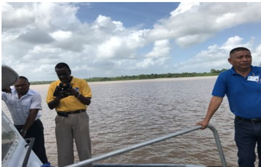
Officials from MARAD observing marking points

The Maritime Administration Department (MARAD) will assume