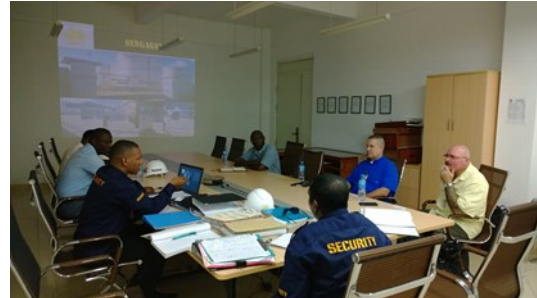
US Coast Guards gets briefing from PFSO

These practices will be recommended to port facilities in the Region with similar security challenges.