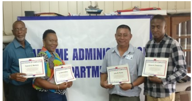
Officers displaying their certificates.

The Maritime Administration Department is currently preparing to be audited for compliance with International Organization of Standards (ISO 9001:2015) by the International Maritime Organization (IMO) in February 2018.